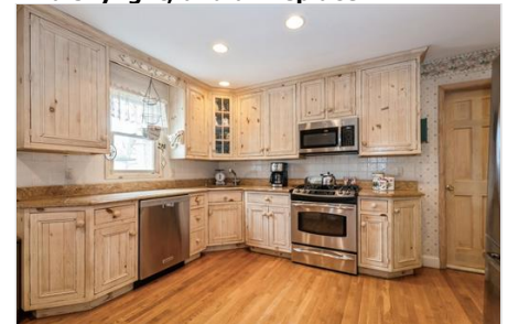
Kitchen with light brown cabinetry, light wood-type flooring, decorative backsplash, glass insert cabinets, and appliances with stainless steel finishes