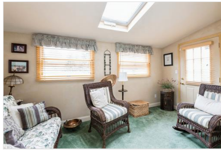
Sitting room with carpet floors, lofted ceiling with skylight, and baseboards