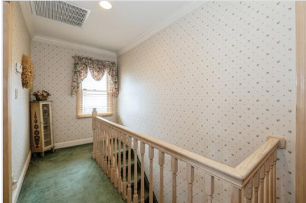
Hall with wallpapered walls, visible vents, ornamental molding, carpet floors, and baseboards