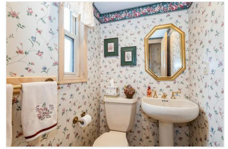
Bathroom featuring toilet and wallpapered walls