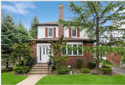
Traditional home with a chimney, brick siding, a front yard, and central AC