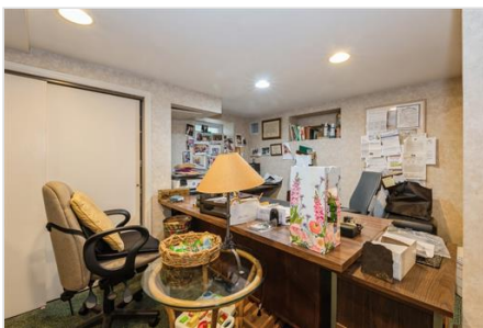
Office space featuring recessed lighting