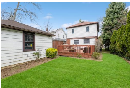
Back of property with a lawn and a wooden deck