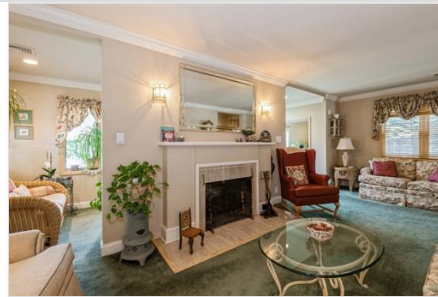
Living room featuring a tile fireplace, carpet floors, visible vents, and ornamental molding