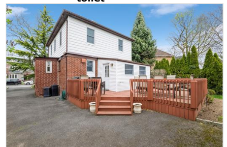
Rear view of property with a wooden deck, brick siding, and cooling unit