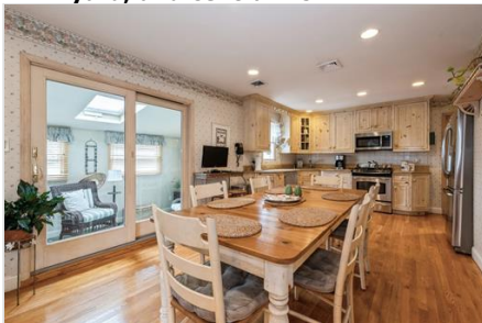
Dining area featuring wallpapered walls, light wood-style flooring, and visible vents