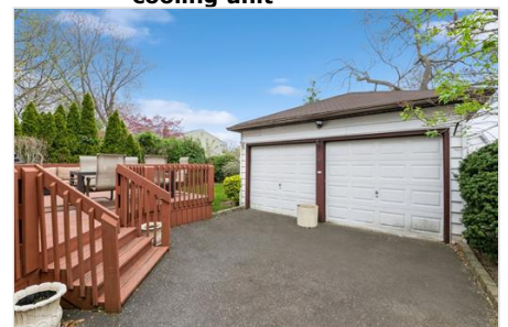
View of detached garage