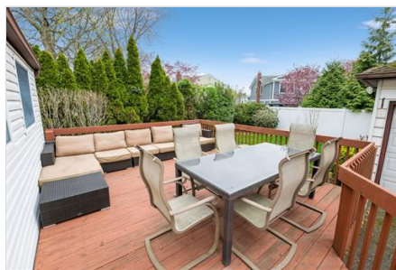
Wooden terrace with outdoor dining area, outdoor lounge area, and fence