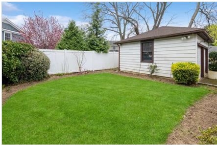
View of yard featuring fence