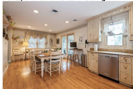
Dining area with visible vents, light wood-style floors, wallpapered walls, and recessed lighting