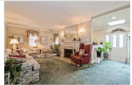
Living room featuring a wealth of natural light, crown molding, a skylight, and a fireplace