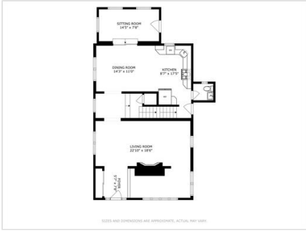
View of layout