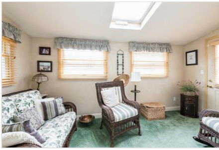
Living area with a skylight, plenty of natural light, baseboards, and carpet flooring