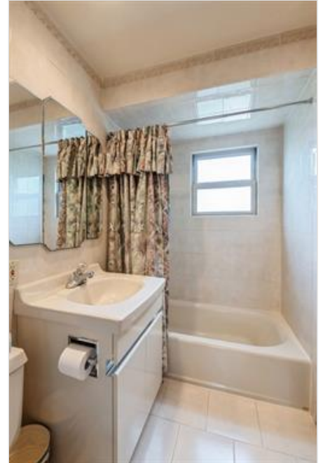
Full bath with shower / tub combo with curtain, tile patterned flooring, vanity, and toilet