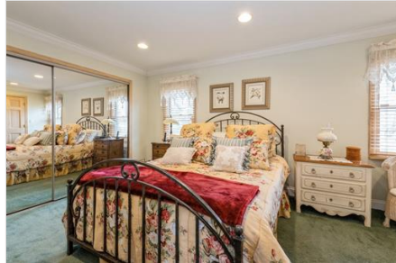
Bedroom featuring recessed lighting, a closet, crown molding, and carpet